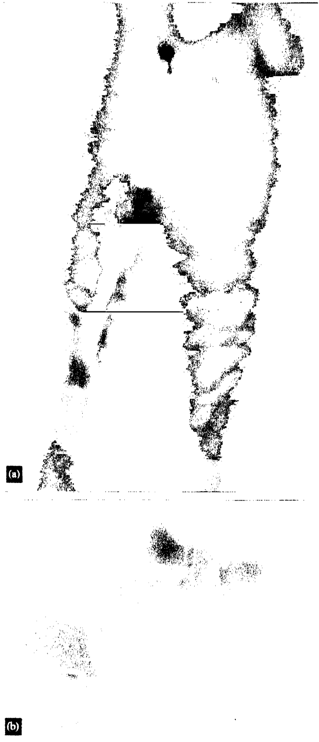
Figure 2. (a) Eosinophilic granuloma on thighs—before treatment. (b) Eosinophilic granuloma on thighs—after treatment.

As this case illustrates, most of the EGC cases treated homeopathically at the clinic respond well to snake remedies. The dilution and frequency of repetition vary from case to case. Duration of treatment varies from several weeks to months or years, the aim being complete cure and disappearance of all the symptoms. In some cases that result is achieved, in other cases the specific remedy has to be repeated sporadically, at months' intervals, when owners suspect early symptoms or when stressful situations