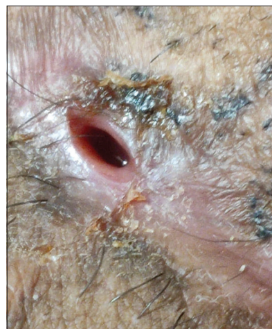
Figure 1: Pilonidal Sinus opening as seen during the first visit (22 November 2022)

His appetite was good, with a strong desire for salty and fatty food. He drank 2.5–3 L of water daily, and his tongue was