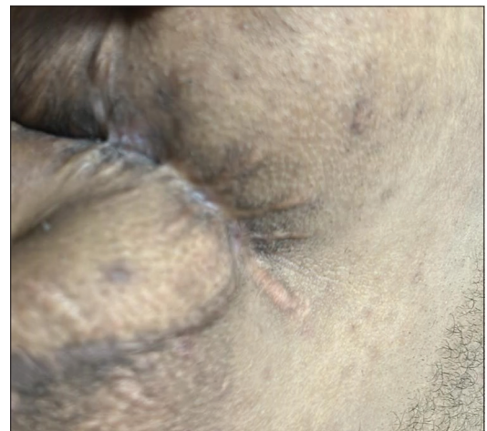
Figure 4: After treatment: The sinus is seen to be totally cleared up during the sixth visit (17 October 2023)

Since PNS is a common inflammatory disease of the gluteal region, [5] with a limited scope of treatment in conventional medicine, it is necessary to assess the role of alternative strategies to reduce recurrence and enhance acceptability for treatment of such apparent surgical conditions. Homoeopathy