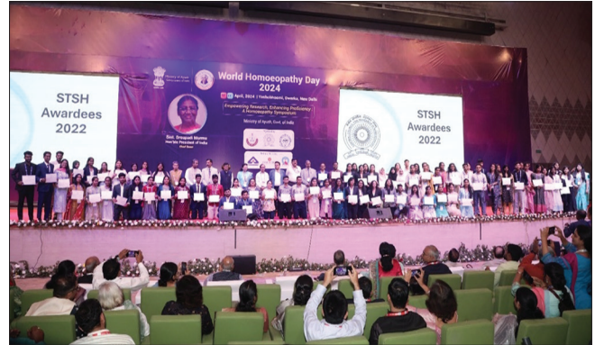
Valedictory Session: STSH (Short-Term Studentship in Homoeopathy) Award Distribution