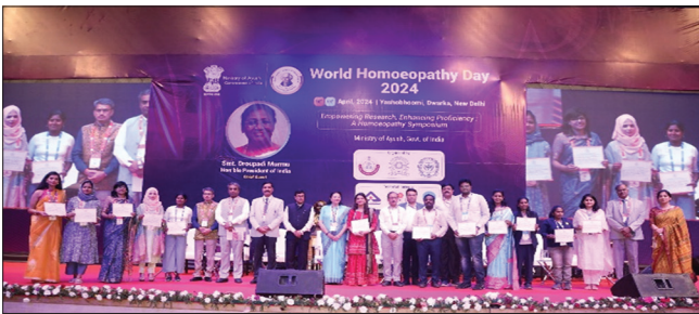
Valedictory Session: MD Scholarship Award Distribution