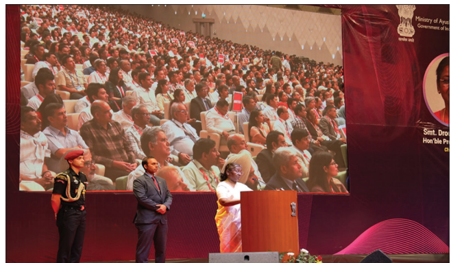
Hon'ble President of India addressing the gathering of over 6000 delegates