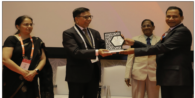
Session 1: Chairpersons of the session being felicitated with the Mementos by Deputy Director General, CCRH