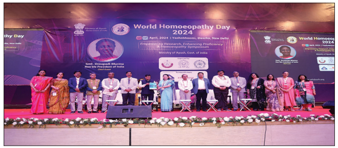
Valedictory Session: Release of CCRH publication "COVID-19 Pandemic: Research by CCRH"