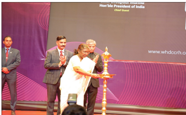
Hon'ble President of India lights the lamp for an auspicious start to the event