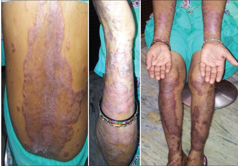
Figure 2: Before treatment (04 February, 2021)

The potency and dosage were determined based on the susceptibility as per the patient's age, pathology and the disease's nature. All the medicines were administered orally. One single dose consisted of five medicated globules of size 30 followed by identical looking placebo. Placebos were advised to be taken thrice daily every day for 15 days. [17] In between