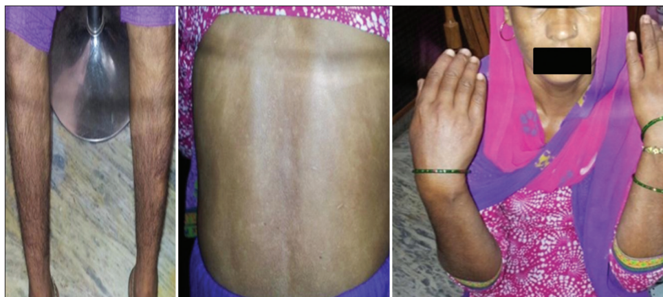
Figure 4: After treatment (12 June 2022)