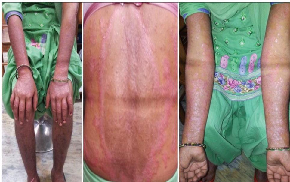
Figure 3: During treatment (19 February 2021–4 April 2022)