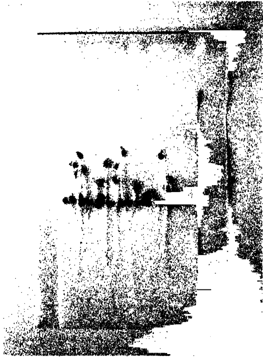
Figure 3 Cress seedlings ( Lepidium sativum L.) stressed with sodium chloride.

with 12c and 24c showed a trend to inhibition (statistically not significant). 40