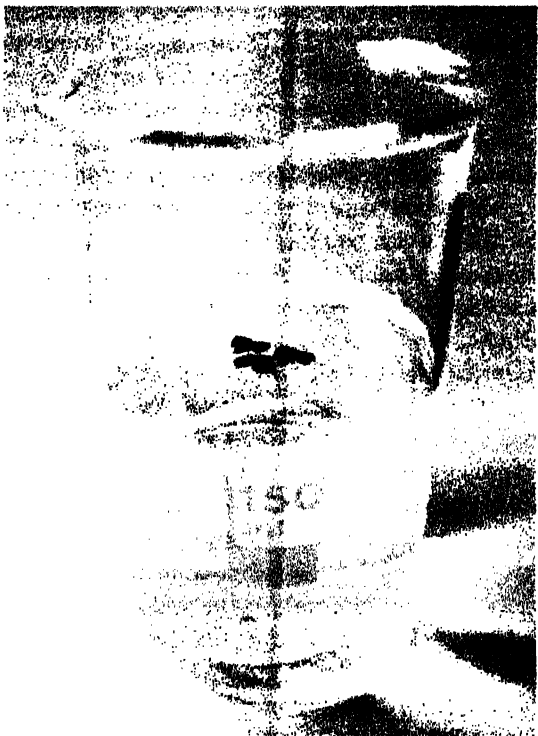
Figure 4 Duckweed ( Lemna gibba L.) stressed with arsenic(V).

Arsenic(V) duckweed model: This study evaluated the effects of homeopathically potentised arsenic trioxide, nosode (prepared of stressed duckweed) and gibberellic acid with duckweed ( Lemna gibba L.) stressed for 48 h with arsenic(V) (Figure 4). These three homeopathic preparations were selected after a screening of 11 different test