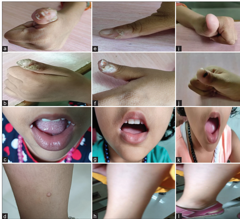
Figure 2: Warts (a-d) before treatment (24 April 2023), (e-h) during treatment (24 May 2023) and (i-l) after treatment (21 June 2023)